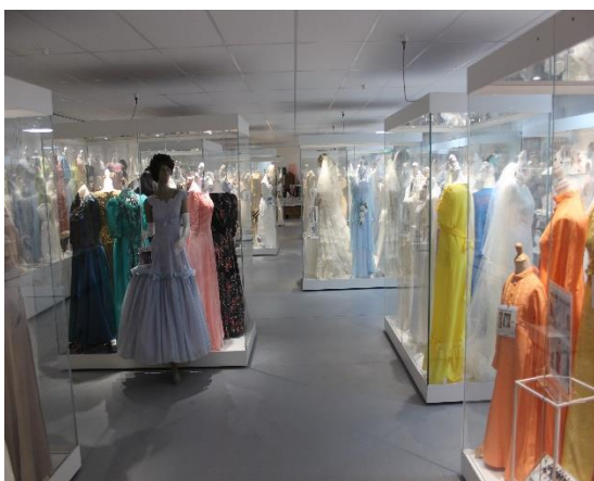
Wedding, Deb, and evening gowns

Walk outside and head towards the other large shed and spend time looking at almost 100 tractors, and farm machinery of all kinds. Before long it will be time to leave this immense collection, which is still evolving, with a promise to return and see it all again.