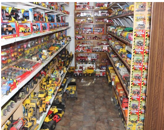
The Tonka toys room