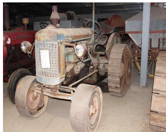
One of the many tractors in the shed